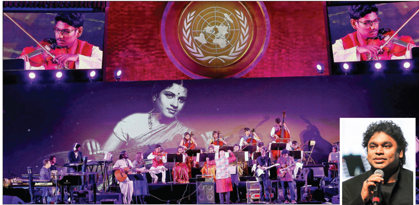
VOICE THAT WOODED MILLIONS: The concert by A R Rahman at the General Assembly of the United Nations on August 15 was organised by Sankara Nethralaya to pay obeisance to legendary Carnatic musician M S Subbulakshmi

Email your feedback to southpole.toi@timesgroup.com