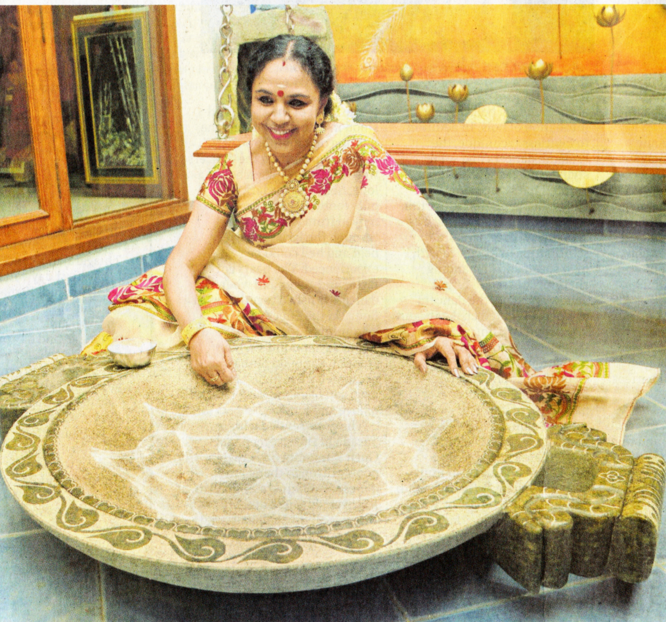
MINING PATTERN Sudha Ragunathan