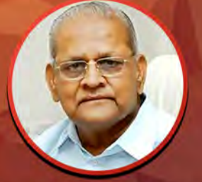
Padma Bhushan Awardee