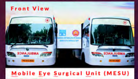
Mobile Eye Surgical Unit (MESU)