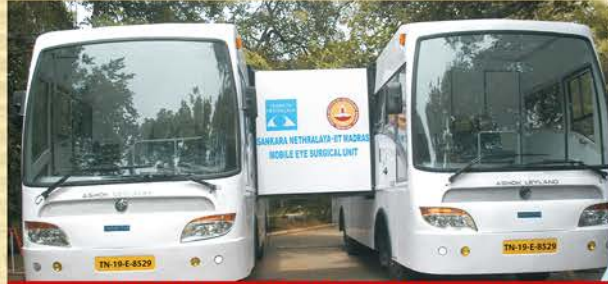
MOBILE EYE SURGICAL UNIT

Starting from Jan 1 st 2024 Sankara Nethralaya MESU (Mobile Eye Surgical Unit) operations are going to be full fledged in Telangana. Please let us know if you like to sponsor MESU Adopt-A-Village in your village.