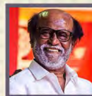
Padma Vibhushan RAJINIKANTH