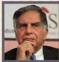
Padma Vibhushan RATAN TATA