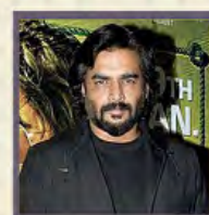
R. MADHAVAN Actor, Producer, Director