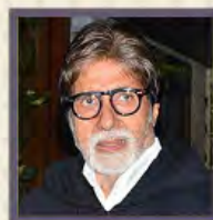
Padma Vibhushan AMITABH BACHCHAN