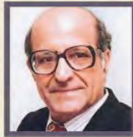
Padma Vibhushan NANI PALKHIVALA