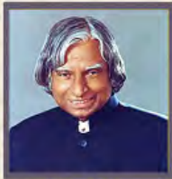
Bharat Ratna Dr. A.P.J. ABDUL KALAM Former President of India