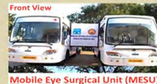
Mobile Eye Surgical Unit (MESU)

Ph: (855) 4NETHRA | (855) 463-8472 www.sankaranethralayausa.org