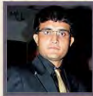
Padma Shri SOURAV GANGULY President, BCCI