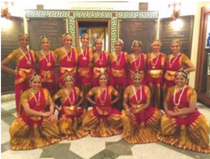
Dazzling performers from the University of Pittsburgh

A colourful, vibrant event espouses Sankara Nethralaya's cause at Maryland.