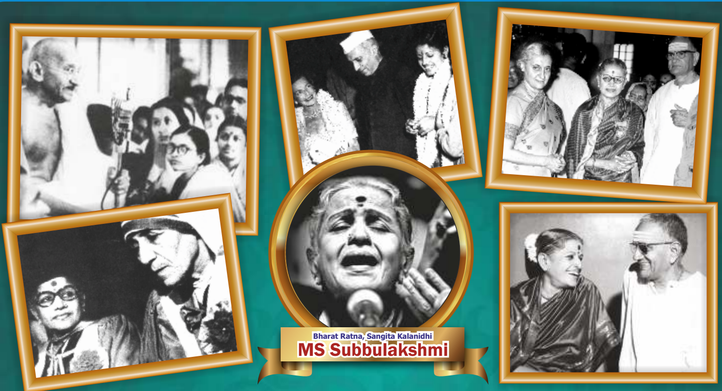
Bharat Ratna, Sangita Kalanidhi MS Subbulakshmi

Golden moments from the life of Bharat Ratna Dr. M.S Subbulakshmi a divine artist and great humanitarian!