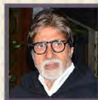
Padma Vibhushan AMITABH BACHCHAN