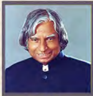
Bharat Ratna Dr. A.P.J. ABDUL KALAM Former President of India