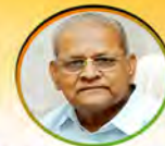
Padma Bhushan Awardee Dr. S S Badrinath Founder, Sankara Nethralaya