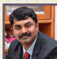
Dr. G. SATHEESH REDDY Chairman, DRDO