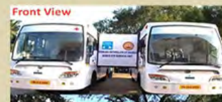
Mobile Eye Surgical Unit (MESU)