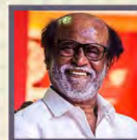
Padma Vibhushan RAJINIKANTH