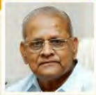
Padma Bhushan Dr. S.S. Badrinath Founder, Sankara Nethralaya