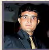
Padma Shri SOURAV GANGULY President, BCCI