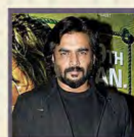
R. MADHAVAN Actor, Producer, Director