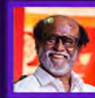
Padma Vibhushan RAJINIKANTH