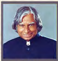
Bharat Ratna Dr. A.P.J. ABDUL KALAM Former President of India