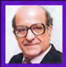
Padma Vibhushan NANI PALKHIWALA