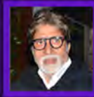
Padma Vibhushan AMITABH BACHCHAN