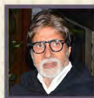
Padma Vibhushan AMITABH BACHCHAN