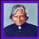
Bharat Ratna Dr. A.P.J. ABDUL KALAM Former President of India