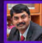
Dr. G. SATHEESH REDDY Chairman, DRDO