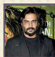
R. MADHAVAN Actor, Producer, Director