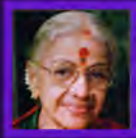
Bharat Ratna Dr. MS SUBBULAKSHMI