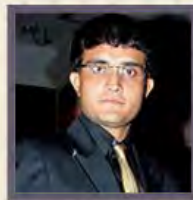
Padma Shri SOURAV GANGULY President, BCCI