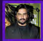
R. MADHAVAN Actor, Producer, Director