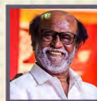
Padma Vibhushan RAJINIKANTH