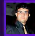
Padma Shri SOURAV GANGULY President, BCCI