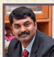
Dr. G. SATHEESH REDDY Chairman, DRDO